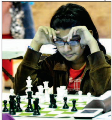
Action from the Under-11 National Chess at Karnavati Club in Ahmedabad on Monday

The season opener 1st Major Ranking Table Tennis Tournament will be held at Surat from June 16 to 19, a Gujarat State Table Tennis Association (GSTTA) press release said. The second ranking tournament will be held at Rajkot from June 30 while the third major ranking TT meet tournament will be held at Ahmedabad from July 13 to 17, the release added.