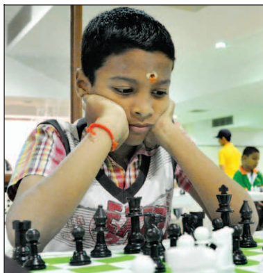
Action from the Under-11 National Chess at Karnavati Club in Ahmedabad on Monday